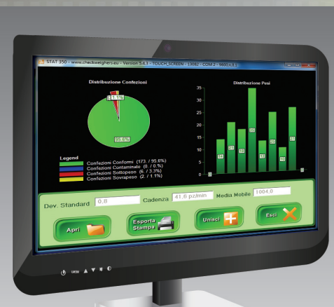
BATCH STATISTICS REPORT