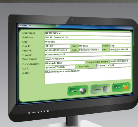
CUSTOMER AND SUPPLIER ARCHIVE