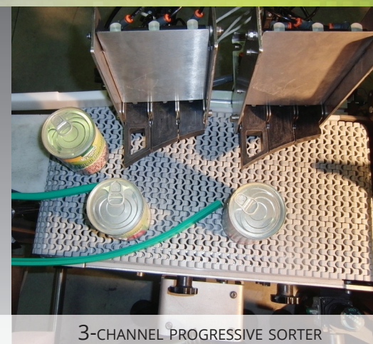
3-CHANNEL PROGRESSIVE SORTER