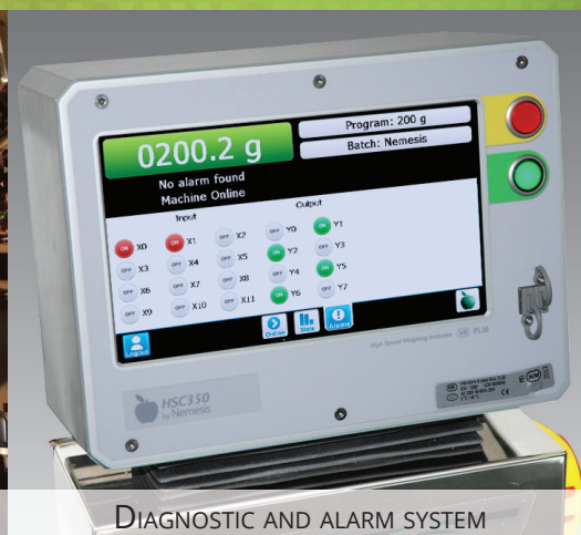
DIAGNOSTIC AND ALARM SYSTEM