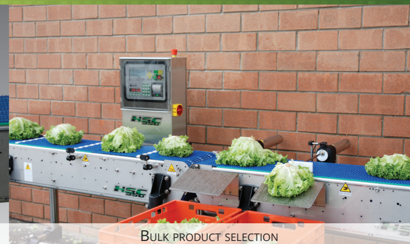
BULK PRODUCT SELECTION

Amongst others, the program provides the following functions: