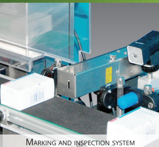
MARKING AND INSPECTION SYSTEM