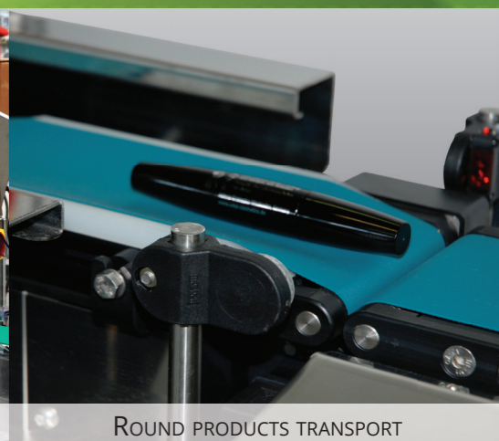
ROUND PRODUCTS TRANSPORT

The HSC350 range of measuring instruments has been designed using sturdy, tried-and-tested measuring technology to meet the industry's growing demands, with special attention to the specific requirements of each manufacturing sector.