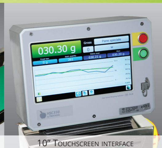
10" TOUCHSCREEN INTERFACE