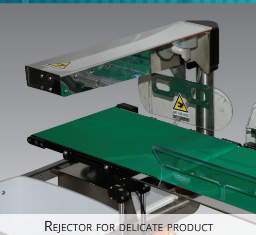
REJECTOR FOR DELICATE PRODUCT

Sturdy and flexible , it can be easily fitted with a Metal detector plus display and labelling systems.