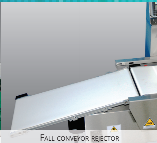
FALL CONVEYOR REJECTOR