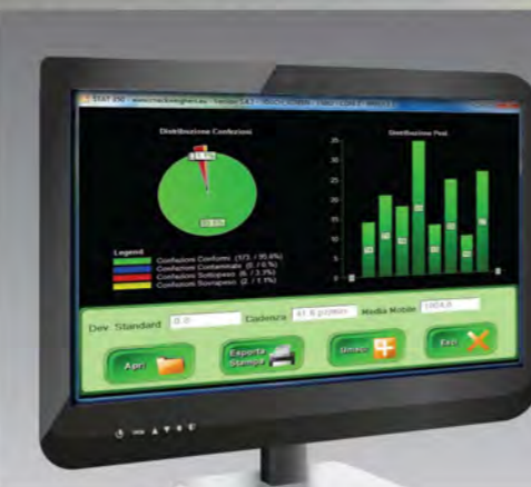
BATCH STATISTICS REPORT