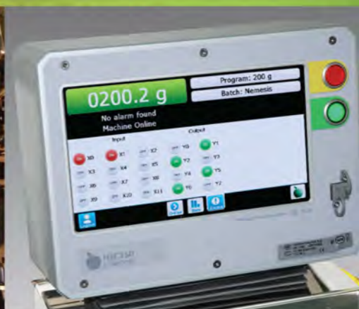
DIAGNOSTIC AND ALARM SYSTEM