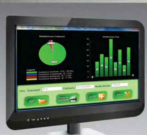
BATCH STATISTICS REPORT