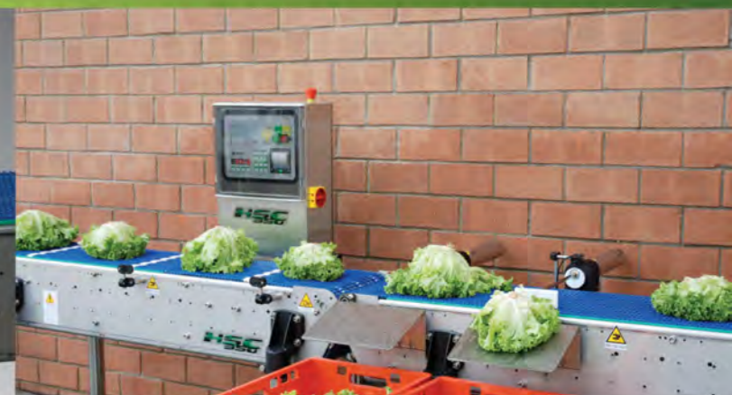
BULK PRODUCT SELECTION

Amongst others, the program provides the following functions: