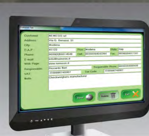
CUSTOMER AND SUPPLIER ARCHIVE