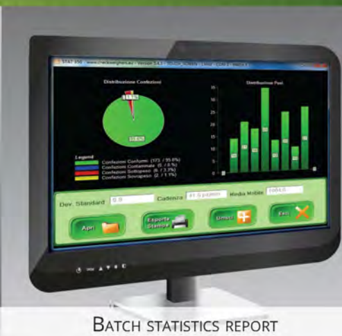
BATCH STATISTICS REPORT

HSC350 "P Series" comprise modular plastic conveyors able to provide the utmost resistance to aggressive substances in the food, manufacturing, chemical and pharmaceutical industries.