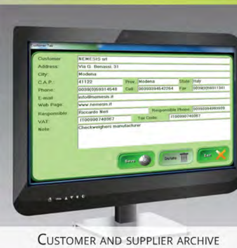
CUSTOMER AND SUPPLIER ARCHIVE